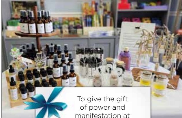
To give the gift of power and manifestation at In The Eyes of Nature.