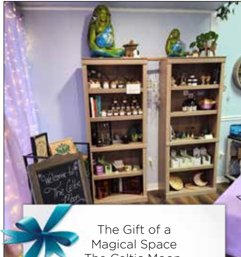
The Gift of a Magical Space The Celtic Moon.