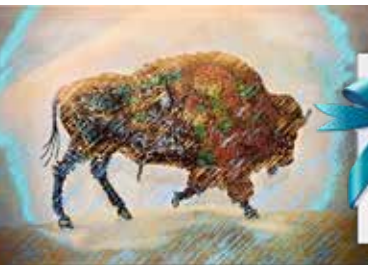
The Gift of Art, Music and Creativity at Marvin's Place