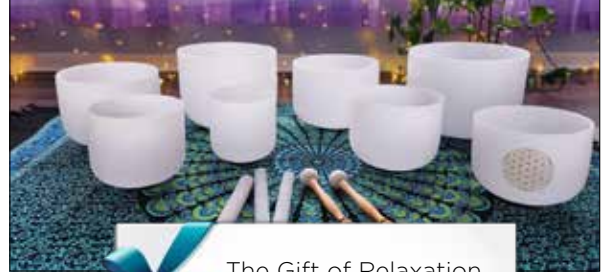
The Gift of Relaxation and Healing at Vibe Wellness