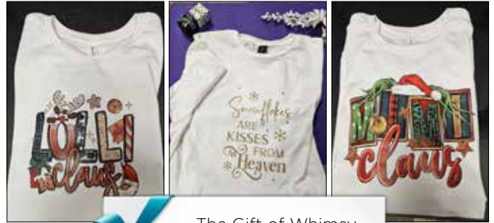
The Gift of Whimsy and Customization to the beat of K-Pop at Forever Euphoria!